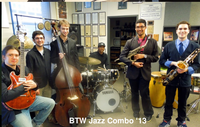
BTW Jazz Combo '13