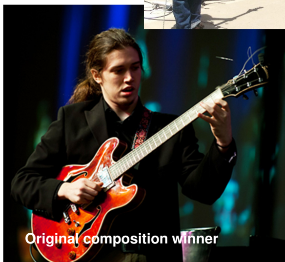
Original composition winner