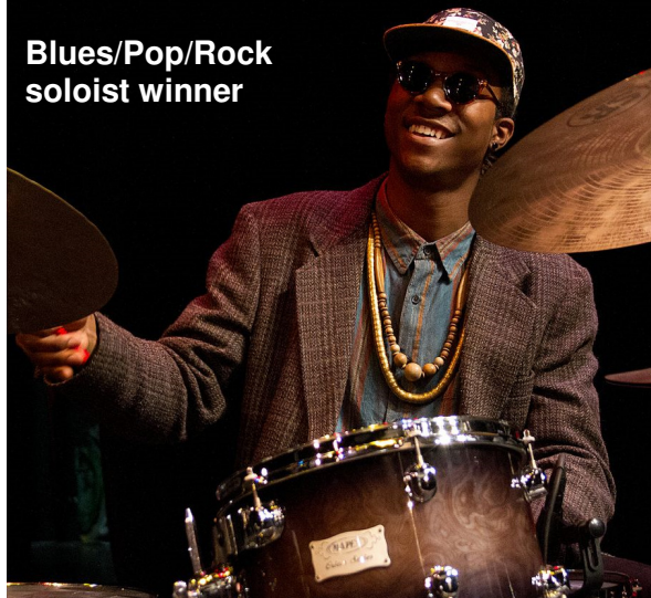
Blues/Pop/Rock soloist winner