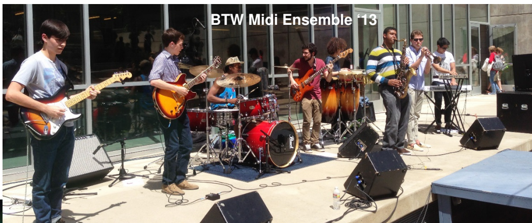
BTW Midi Ensemble '13