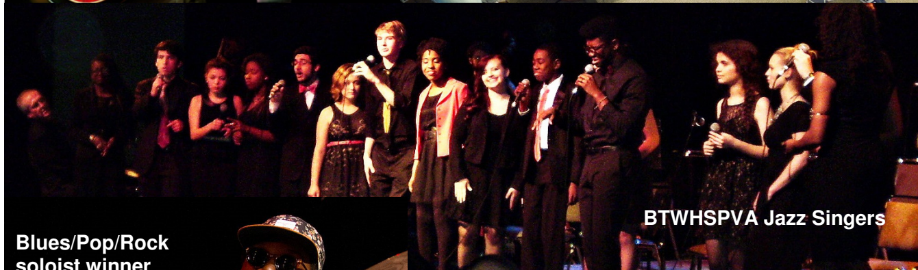
BTWHSPVA Jazz Singers