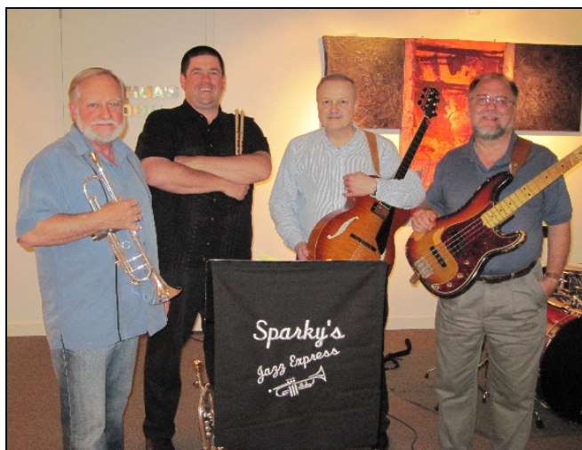
Sparky's Jazz Express at Texas Arts Alliance Center of Clear Lake, Texas.