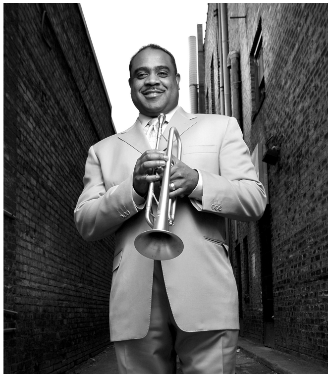
Terrell Stafford headlines a free jazz clinic and performance with the Baylor Jazz Ensemble in February. See Baylor Jazz page 2.