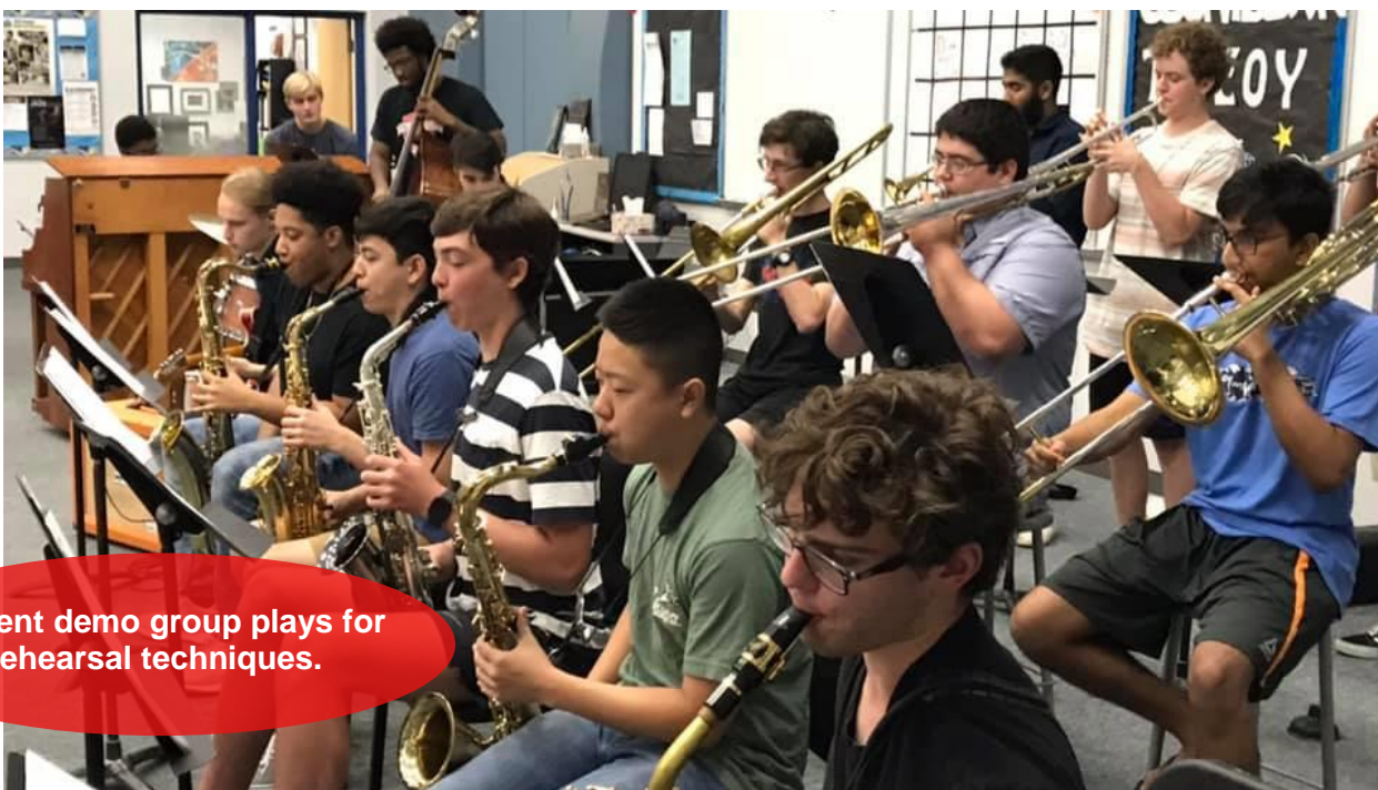
Student demo group plays for rehearsal techniques.