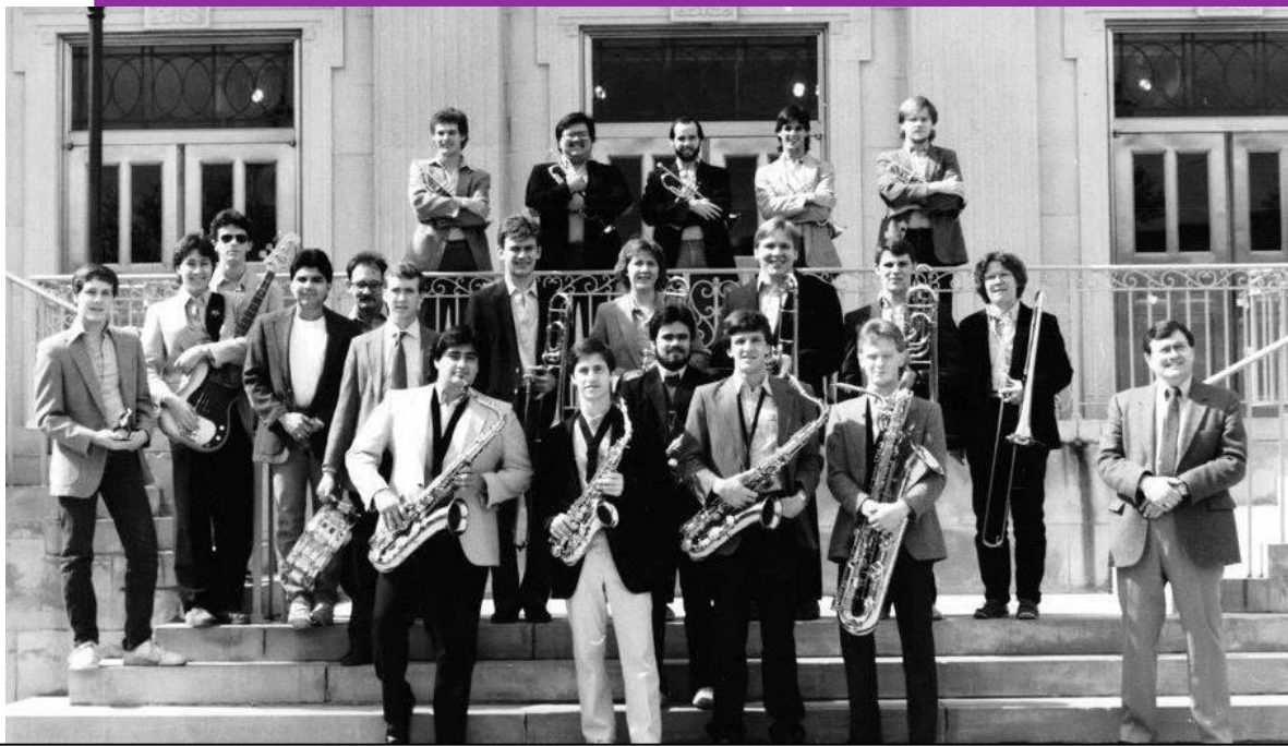
TCU Jazz Ensemble 1985 and below, 2019, thirty-four years apart. Not the exact same personnel but most in the alumni group were from the 1980's.