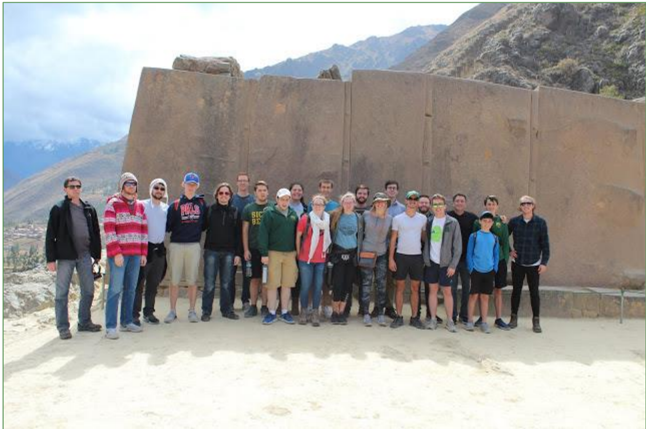
The final stop on the trip was Machu Pichu.