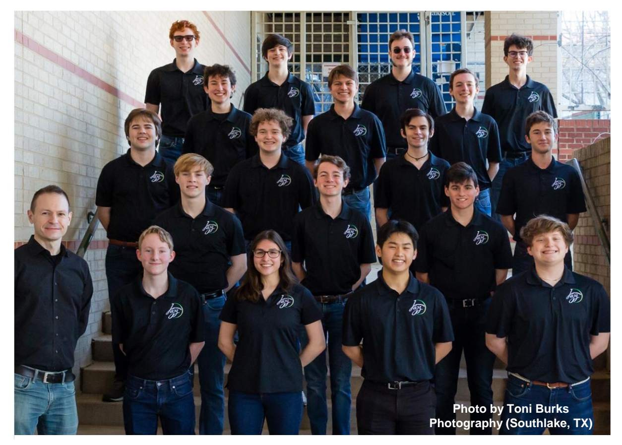
Carroll High School Jazz Ensemble