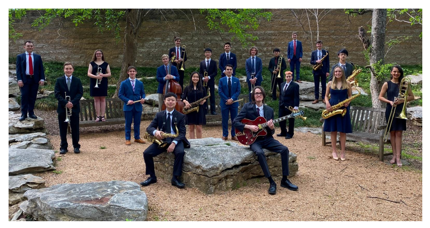
Plano West Jazz Ensemble